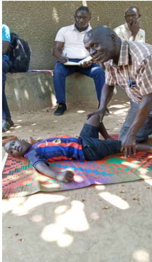
Physiotherapy services in home areas