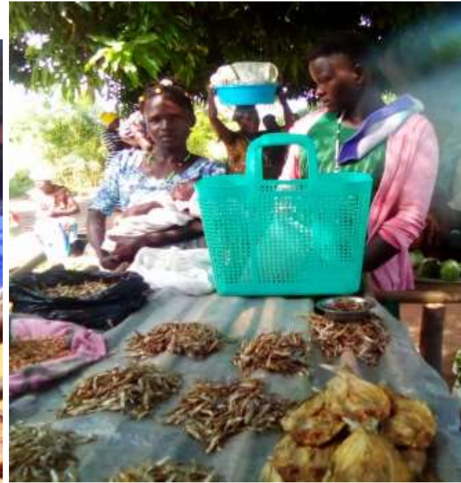
Market day and display of sales to customers in

The teen mothers attend to their kids during working days to give them full support,