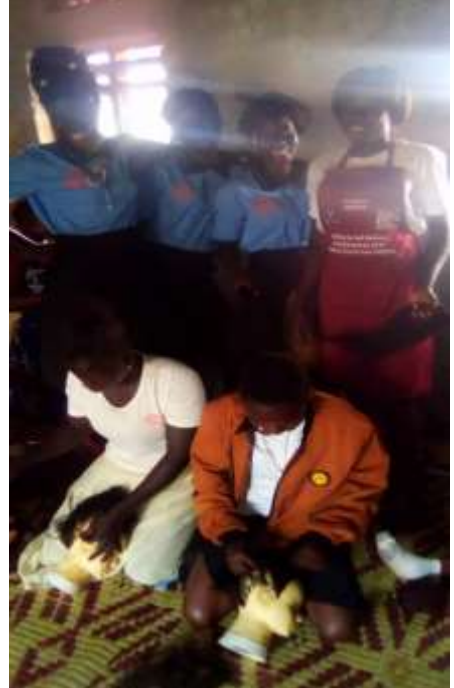
Hair dressing &