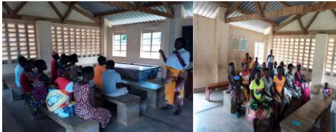
Trainer with trainees