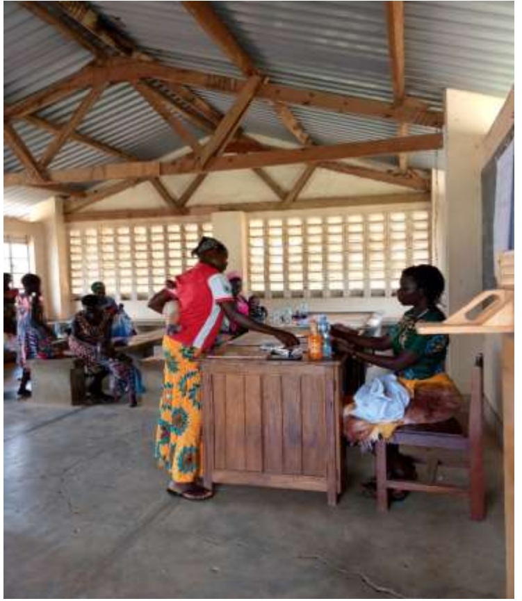
Trainees for lunch break after training