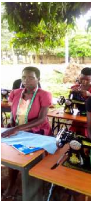
Tailoring and fashion design