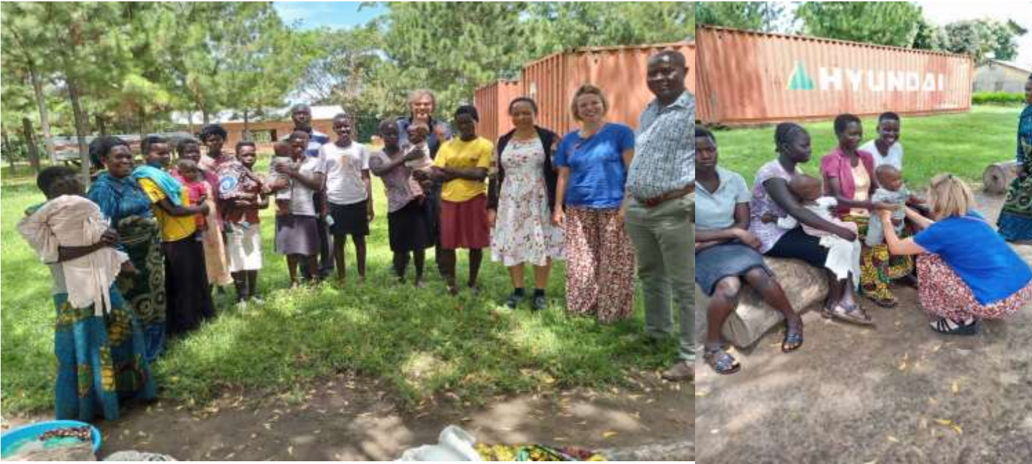
Team of volunteers from Netherlands with WAF staff visited teen mothers at the school during admission day