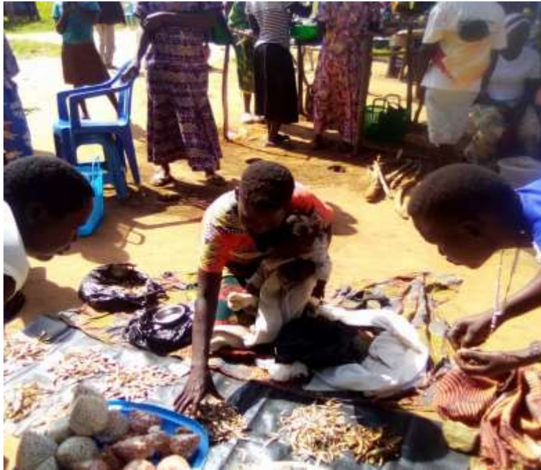
Customers buying from her during her takers her business near to customers in busy days organized form

Direct businesses: Three teen mother identified to do businesses and were given startup capital to buy the stock and are doing well