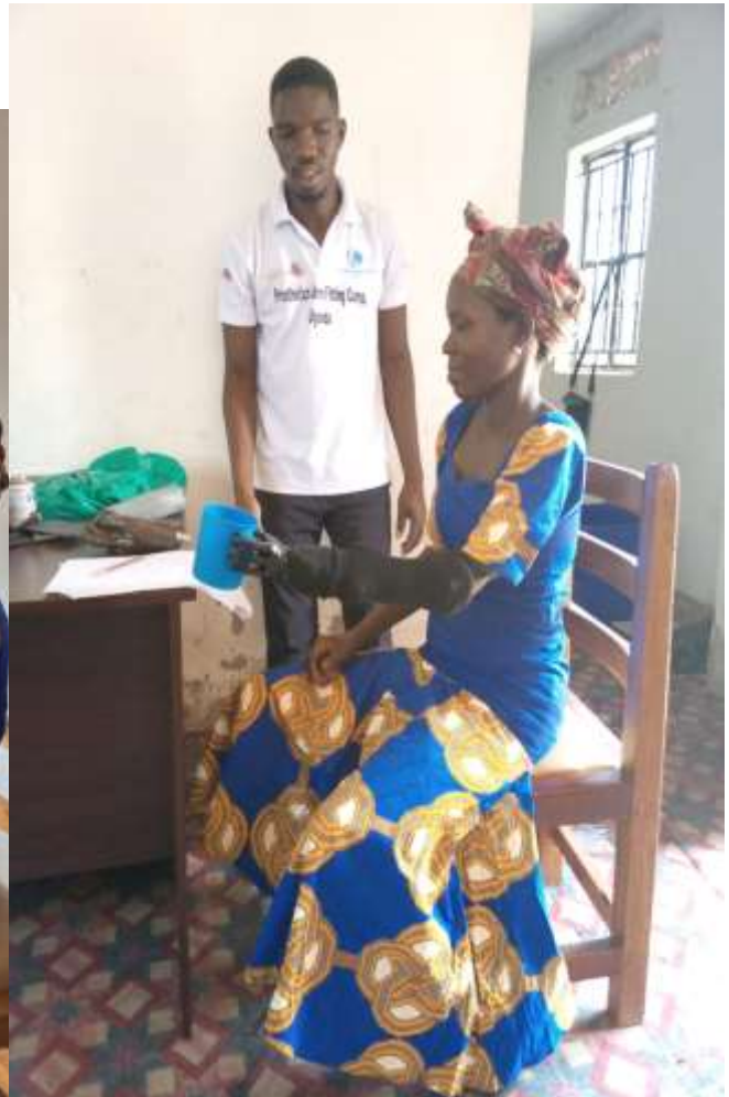
Woman got fitted with prosthesis in Arua city