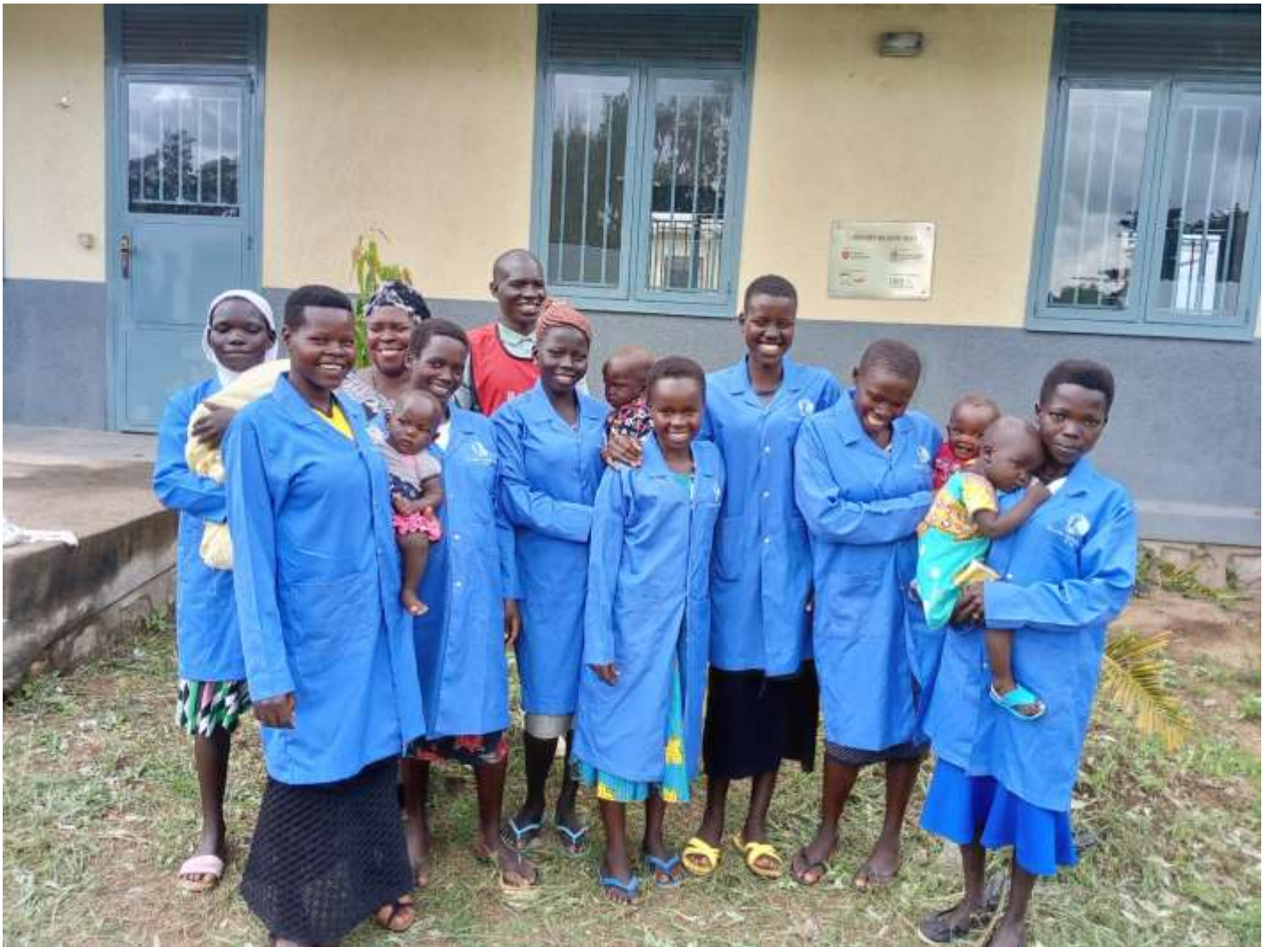
Team of trainees with their trainer in “red”