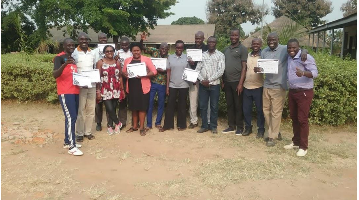
Trainees and trainers