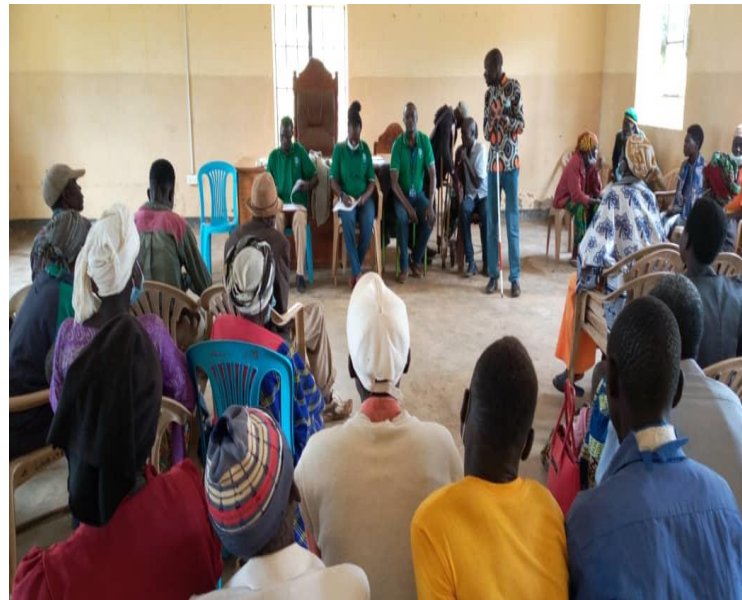
Administration Police at Sub-county