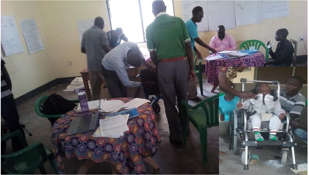
Trainees undergoing training at Ediofe Youth Centre-Arua