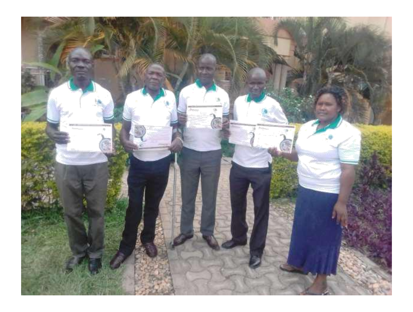
WAF Trainees pose for photos independently