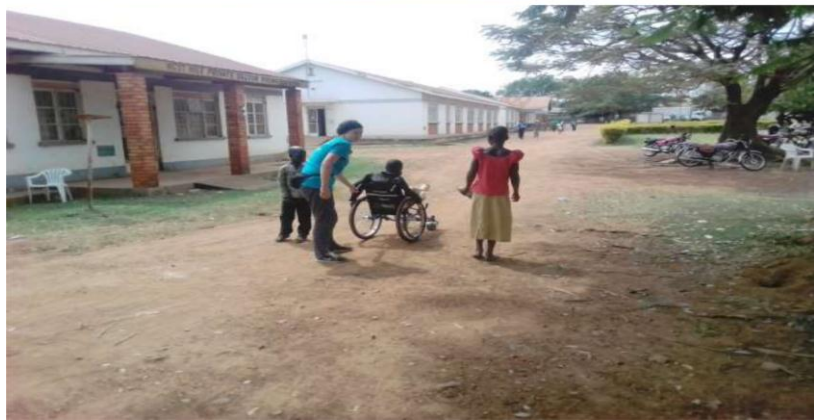
Yana the donor team of volunteers training the beneficiaries in Nebbi, many children with multiple disabilities turned up, and most of the missed