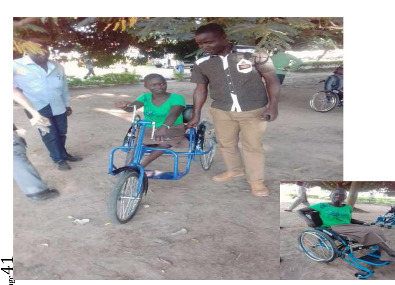
A young lady on training in Arua hospital ground