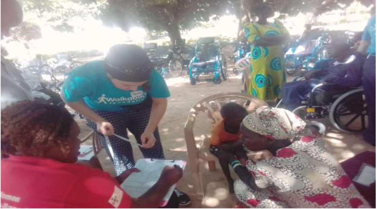
Team of donors and partners attending to the clients in Nebbi