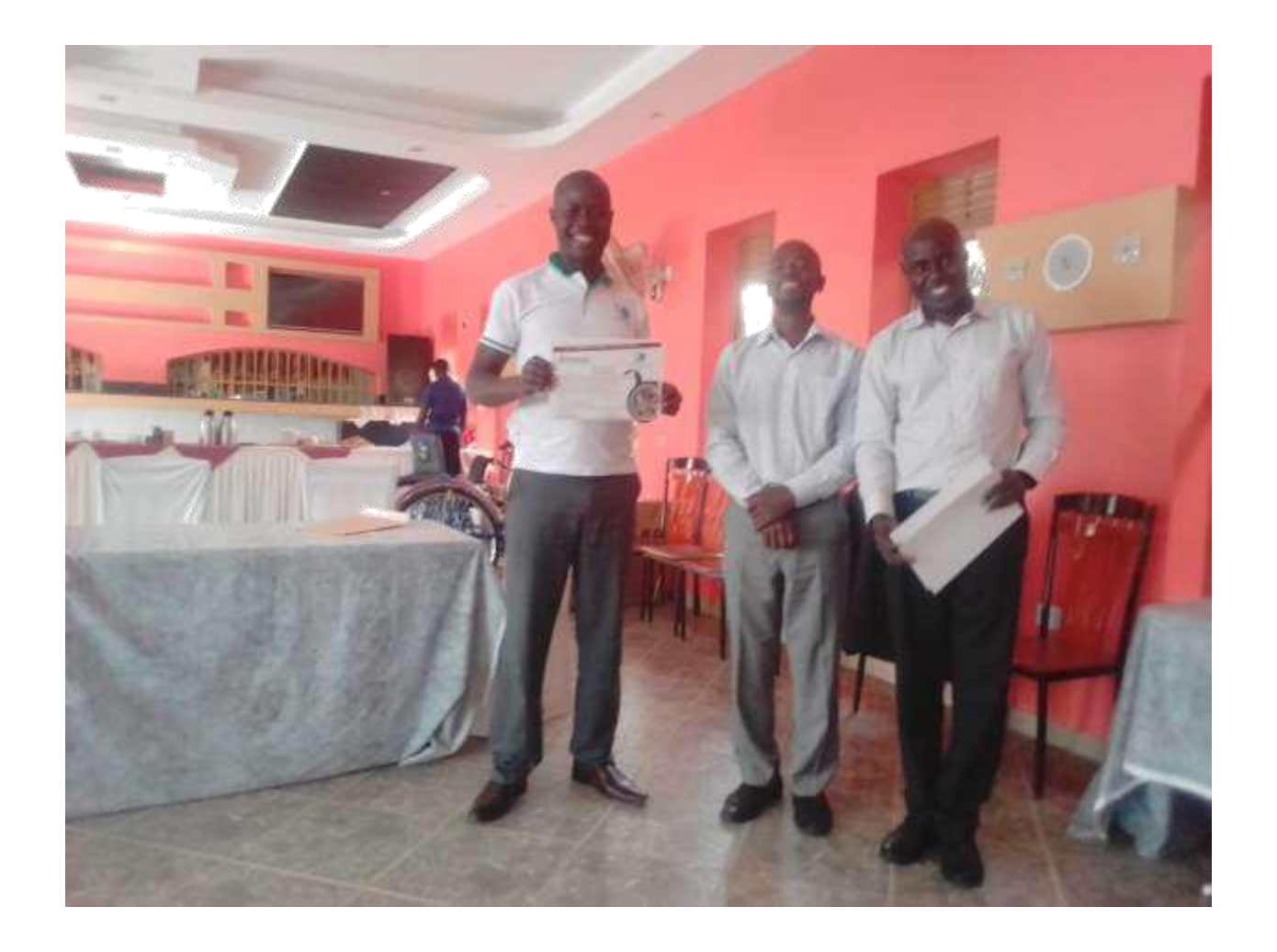
The Executive Director of WAF received his certificate of attendance