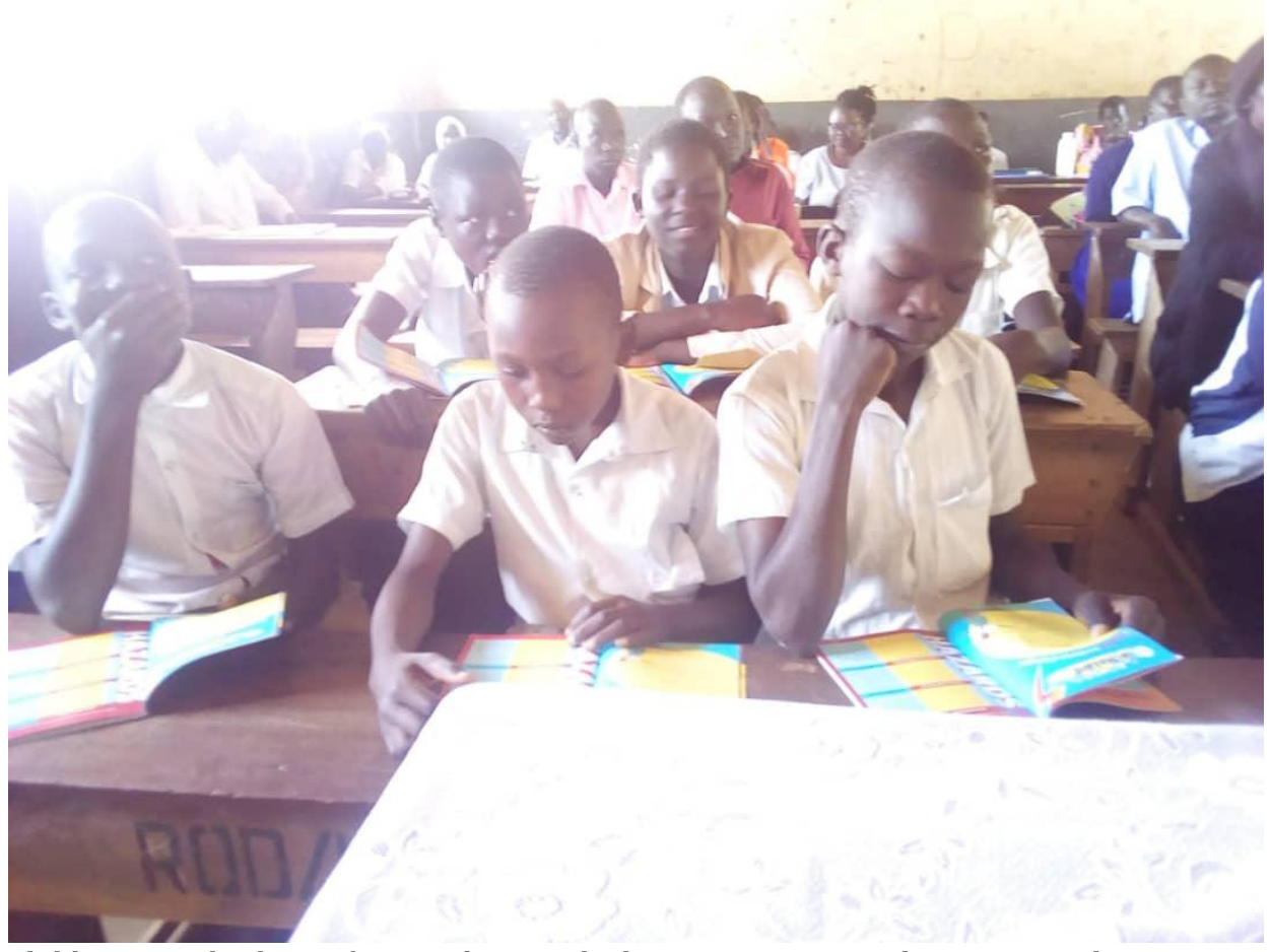
Children mostly those if P.7 and P.6 picked more interest as the topics in the booklets were mostly though, and this would improve their exiting knowledge.