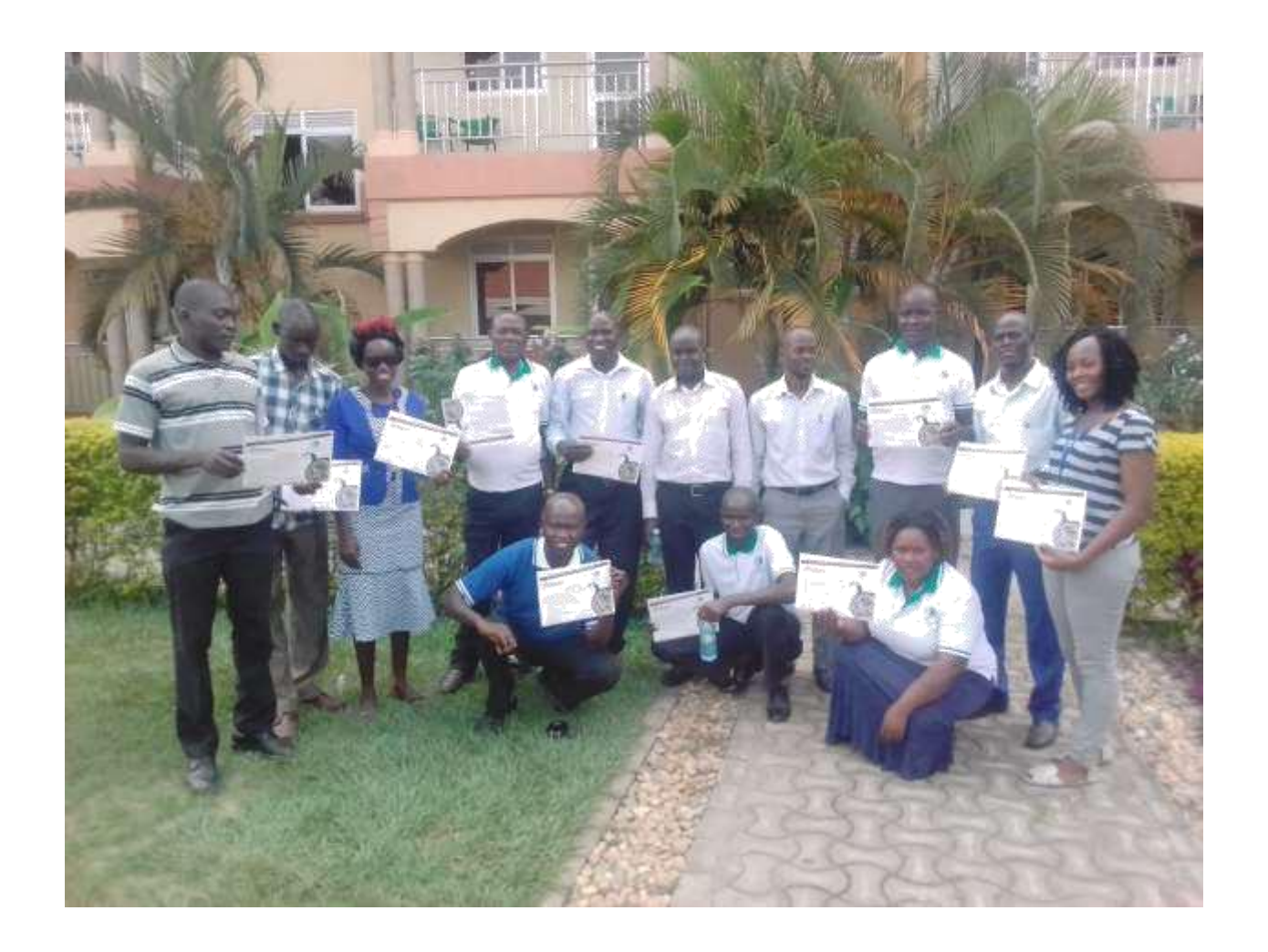
Group Photos trainees and trainers during the training in front of the hotel