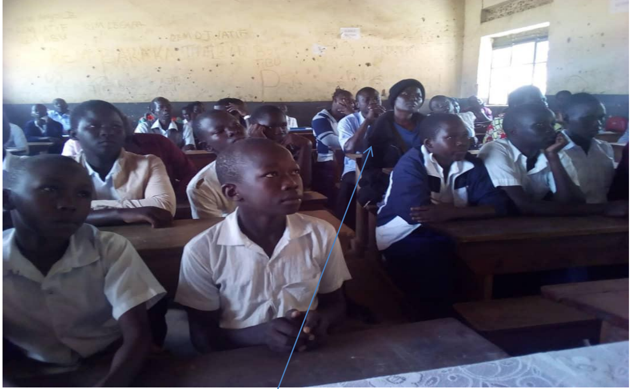
Their teachers also attended