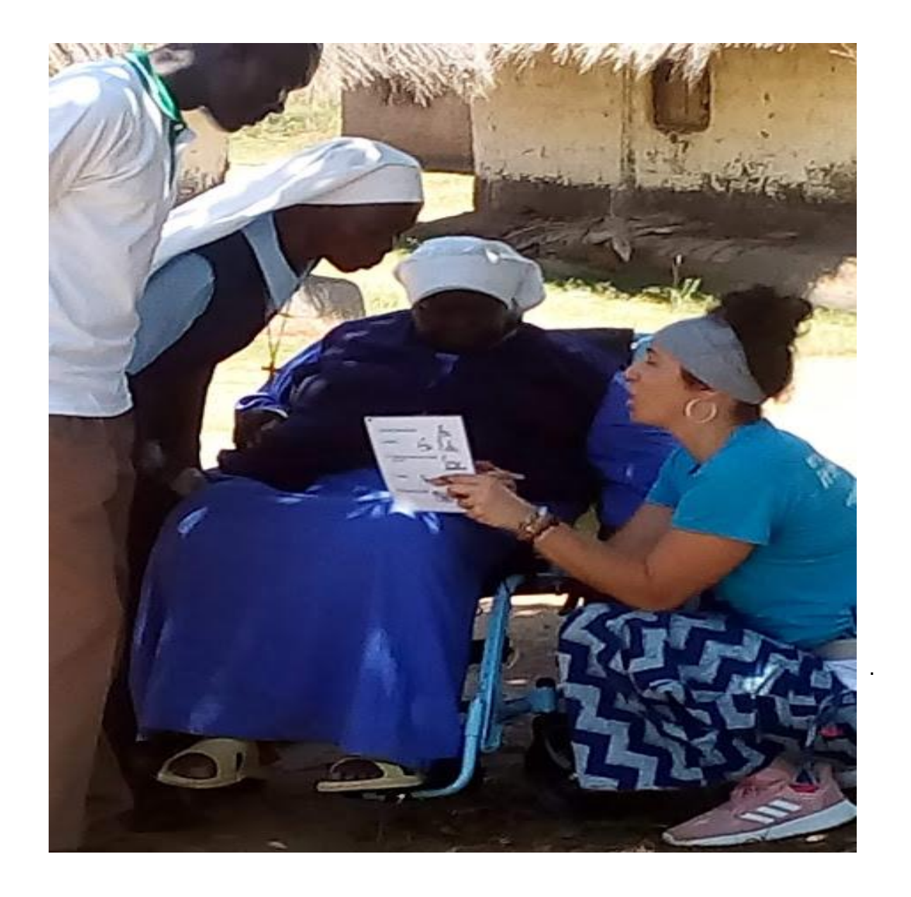
Partner helping Rev. Sister in Nyaravur