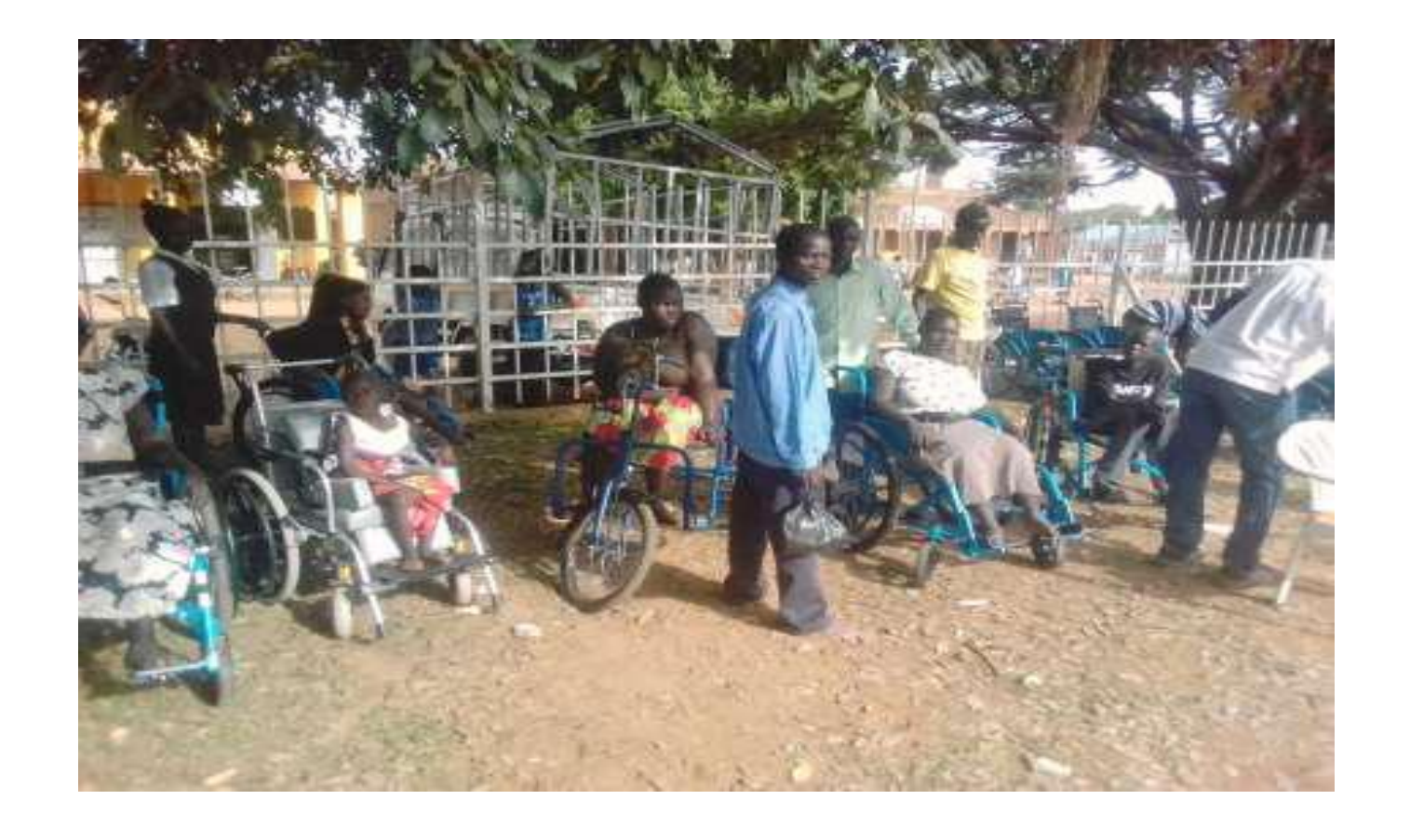
Walkabout Foundation team, re-assembling appliances and adjusting before issuing out Group photo for beneficiaries in Nebbi town centre