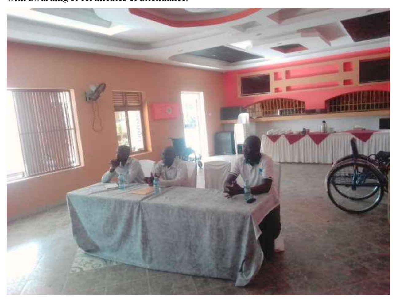
Panellists and trainers with WAF Executive director preparing to handover certificates to trainees

In November 2018, a 15 member trainees, 7 from WAF and 8 from Baptist Mission and Hope Health Action were hosted by World Action Fund for Training organised by Walkabout Foundation modal of WHO wheel chair and Tricycle management. 5 day training of trainees by trainers from national referral hospital Mulago orthopaedic department successfully finished the training with awarding of certificates of attendance.