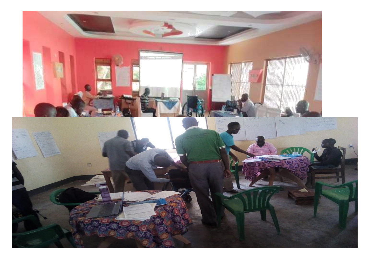
Intermediate training in Ediofe Youth centre

7 Days training to equip the team with complete management of paediatric (children)